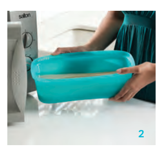
Step 2: Place, uncovered, in the microwave oven and cook.