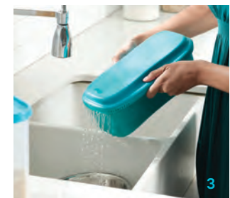
Step 3: Remove the Pasta Maker carefully from your microwave oven. Drain above the sink and enjoy!