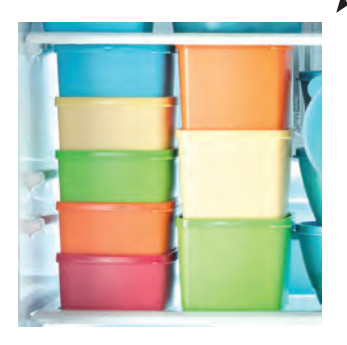
With easy to apply air-tight seals, these attractive square rounds are great for fridge, drawer, cupboard and countertop.

Designed to be modular, stackable and space saving.