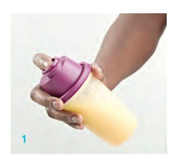
Step 1: Break 2 to 4 eggs into a Quick Shake. Add 15 ml water or milk. Mix together.