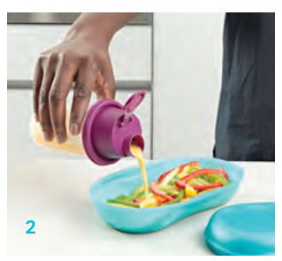
Step 2: Place ingredients into the base and pour the egg mixture over