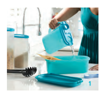
Step 1: Fill the base of the Pasta Maker with pasta to the desired level. Add COLD tap water