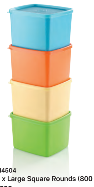
114504 4 x Large Square Rounds (800 ml) R299

Fill your fridge with single portions or entire meals in these classic containers designed to stack and store.