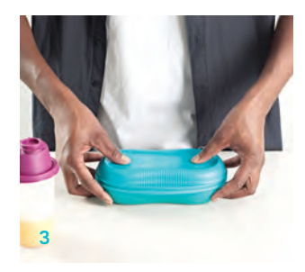
Step 3: Cover and microwave. See product leaflet for more information